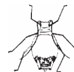
Bird Cherry-Oat Aphid Olive-green with red patch on back of body

Either of these products can be obtained by contacting your County Extension Agricultural Educator, or requesting a copy via my e-mail address: