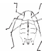
Greenbug Green with dark stripe down back

rtom@okstate.edu . Include your name, mailing address and phone number with your request. If you have any questions about using Glance 'n Go or the Expert System, check out the following OSU Current Report: CR 7191 , The Cereal Aphid Expert System and Glance 'n Go Sampling for Greenbugs: Questions and Answers which can be accessed at http://entopl.okstate.edu/gbweb/index.htm